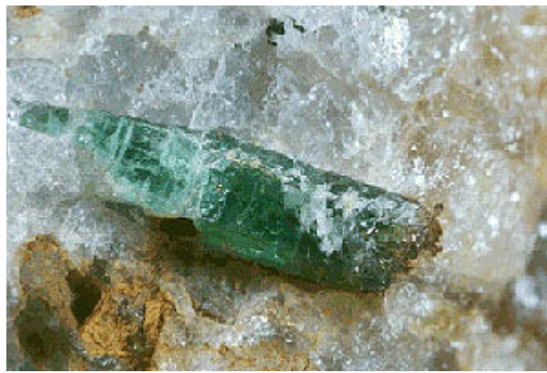
Yukon emeralds